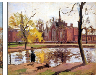
C. Pissarro Dulwich College