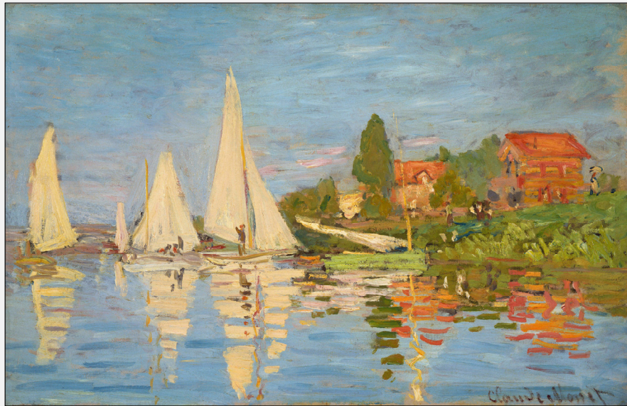
An Impressionist Calendar

An introduction to the 19th Century painters known today as the French Impressionists . Although familiar and accessible in the 21st Century, their work was challenging and game changing in its time. We will trace the evolution of the movement, year by year, and follow the artistic development of artists such as Manet, Monet, Pissarro, and Renoir as they explore radical new techniques which will allow them to capture truthful records of contemporary life.