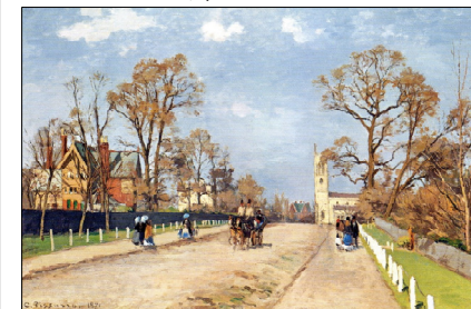
C. Pissarro Dulwich College