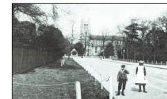
C. Pissarro The Avenue, Sydenham

1870 / 71 C. Monet Hyde Park Monet & Pissarro in London