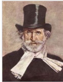
Music by Giuseppe Verdi