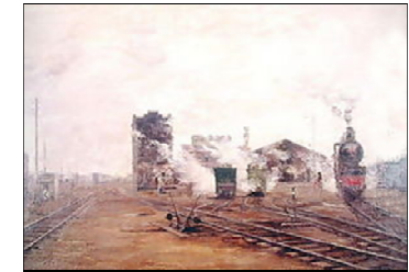
Transport is being laid

We will provide a true picture of events... We will depict the present day: the life of the Red Army, the workers, the peasants, the revolutionaries, and the heroes of labour