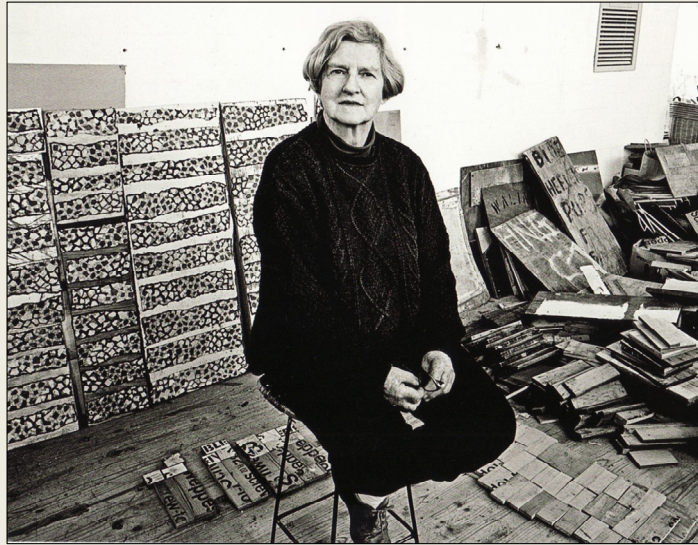
Rosalie Gascoigne 1917-1999

Survey of the life, work and achievement of the New Zealand born artist Rosalie Gascoigne. Follows the productive, yet brief career of this unique “late developer” whose career blossomed during the last decades of her life. Gascoigne’s innate curiosity and her willingness to challenge expectations relating to materials, form and modes of presentation allowed her to create an exciting body of work that is characterised by a sensitivity to the visual and tactile beauty of the natural environment and an acknowledgement of the hidden qualities often overlooked in man made objects.