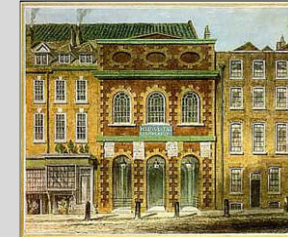
King's Theatre, Haymarket, London