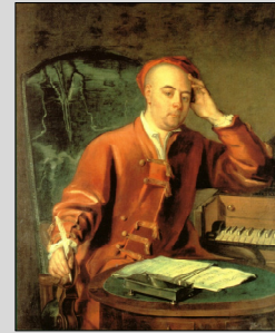
George Frideric Handel