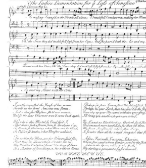
The Ladies Lamentation for the loss of Senesino