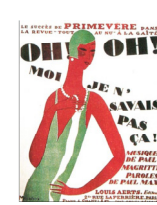
Early artistic endeavours