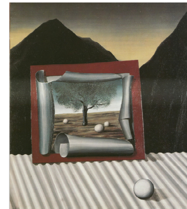
Magritte Signs of Evening 1926