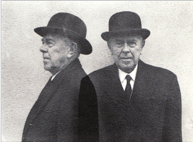
Rene Magritte 1898-1967

Survey of the life, work and achievement of the Belgian surrealist, Rene Magritte. Describes his early investigations into modernism and the turning point that came in 1925. Magritte's involvement with other Surrealists and their shared common ground is considered, but the main focus is on Magritte's unique imagery and his evocative, self contained, self referential art. Many examples of the artist's poetic narratives are analysed and Magritte's writings on art and perception are discussed.