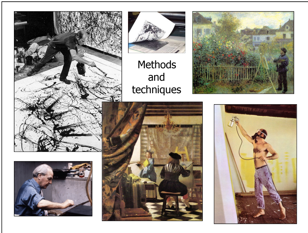
Methods and techniques

Introduction to a variety of painting and printmaking techniques and modes of art making. A selection of artists from across the centuries are considered including Giotto, Botticelli, Leonardo, Caravaggio, Velasquez, Toulouse Lautrec, Monet, Picasso, Heartfield, Pollock, Rauschenberg, Rothko, Bacon, Frankenthaler, Olitski etc. Processes and rationales are explained with reference to specific examples of work by each artist.