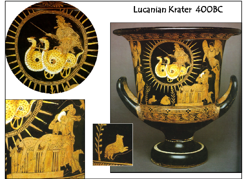
Lucanian Krater 400BC

Considers the longstanding attraction that Medea as a character has held for visual artists, authors and playwrights. A wide range of interpretations is discussed - from the earliest depictions on Greek vases to frescoes and dramatic narratives on Roman sarcophagi, to various literary treatments by Seneca, Chaucer and Boccaccio, paintings by Rembrandt and Delacroix and surprising 20th Century interpretations. Also considers the ongoing relevance of the social and psychological issues embedded in Medea's story.