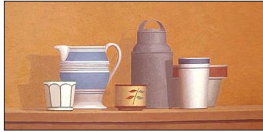
The Meanings of Still Life