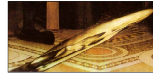
Anamorphic reminder of death memento mori