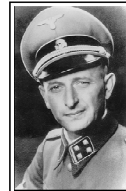
Adolf Eichmann Central Office of Jewish Emigration