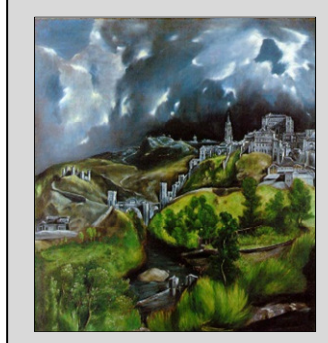
Threatening Skies and Threatened Innocence