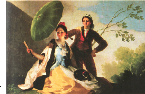
The Parasol 1777