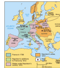
ⓧ Napoleon's Empire: By 1812, Napoleon directly ruled or controlled most of Europe.