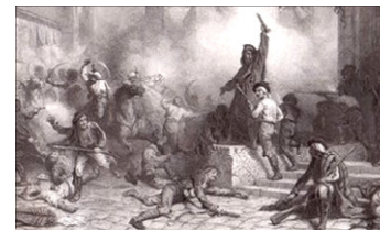
Napoleon moves on Spain 1808

Survey of the life, work and achievement of the controversial Spanish artist, Francisco Goya. Provides social, historical and artistic contexts and traces the path of Goya's career from a village in Aragon to the court of the Spanish monarch and eventual exile in France. Examples of Goya's tapestry designs, frescoes, portraits, etchings and subject paintings are discussed and considered in relation to the artist's biography. Particular focus is placed on Goya's artistic responses to Spanish life, Enlightenment ideas and Napoleon's military exploits.