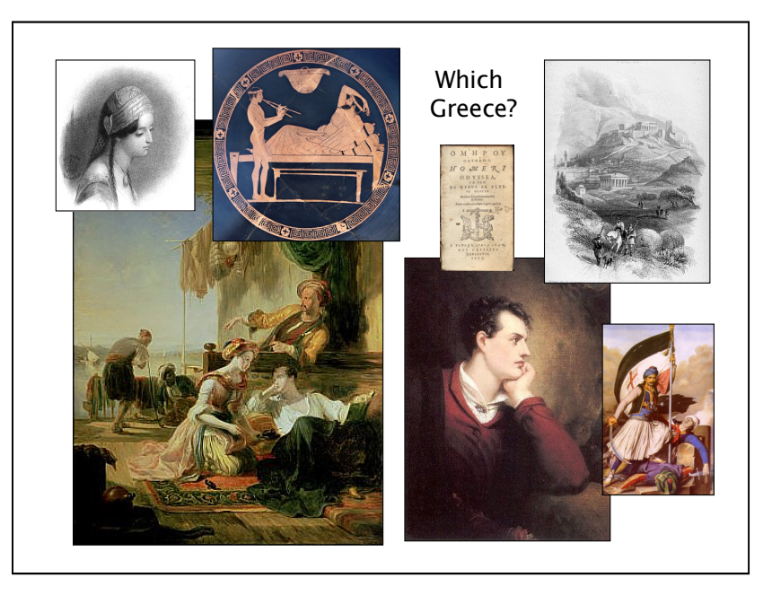
50 Slides & Video 1 x 75 Minute session