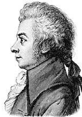
Wolfgang Amadeus Mozart

Discussion of Louis Nowra's Così and the inspiration for his play, Mozart's opera Così fan Tutte . Provides an introduction to Mozart, his approach to opera, and the background to Così . Considers the themes of arcadian romance and a "school for lovers", and presents the concept of "words versus music" in relation to the characters in Nowra's play.