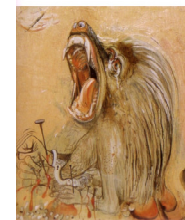
Art, Life and the Other Thing 1978

Survey of the portrait in Australian art with a particular focus on the mid to late 20th Century. Discusses the various purposes served by portraiture and considers examples by a wide range of Australian artists. Political portraits, celebrity portraits, intimate portraits and self portraits are analysed and compared. Processes and techniques are discussed and several portrait related controversies are introduced. Artists included are Pugh, Dobell, Olsen, Whiteley, Hannaford, Amor, Cullen etc.