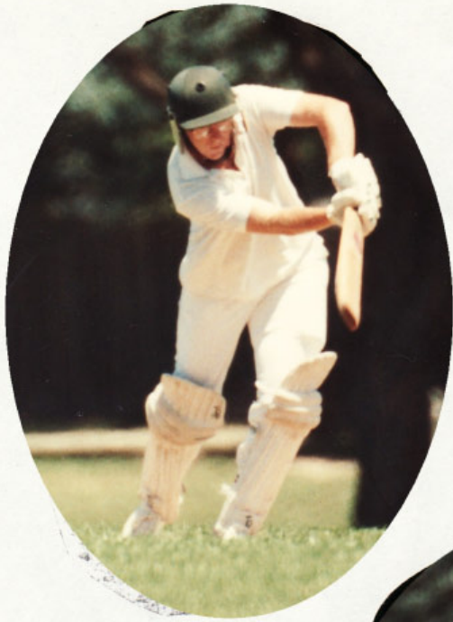
LAXXY IN FULL FLIGHT