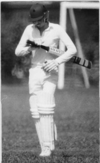
ON YOUR BIKE SWOOPER!