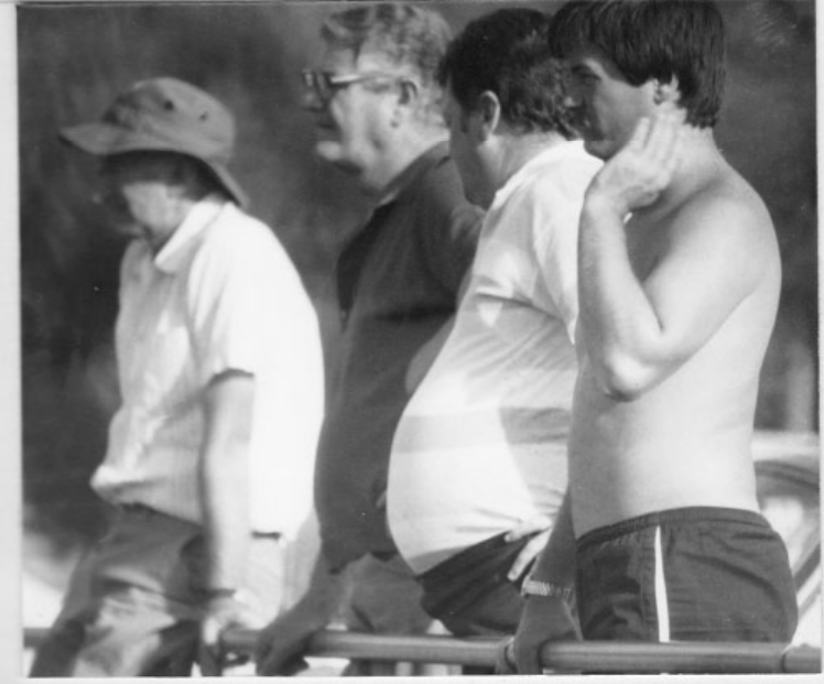
KERRIMUIR BRAINS TRUST